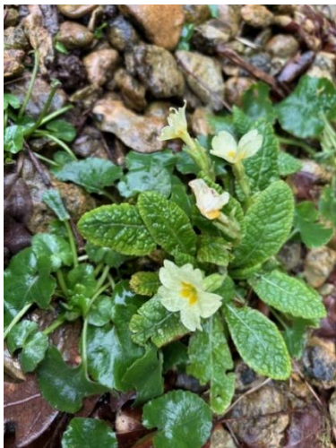
First primroses and daffodils at St John's