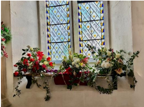
A selection of floral Christmas decorations at St John's