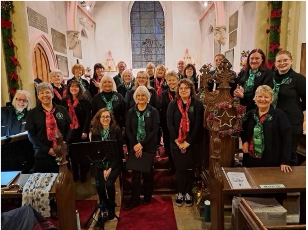
The Wiltshire Singers Choir provided the entertainment at St John's Festive Concert on 5 December